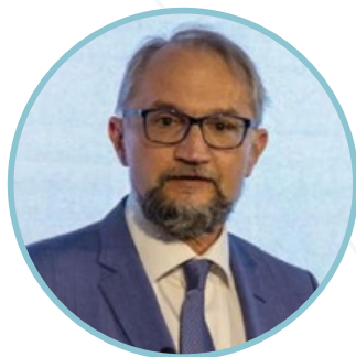
Vladimir Mozetič Kvarner Health Tourism Cluster